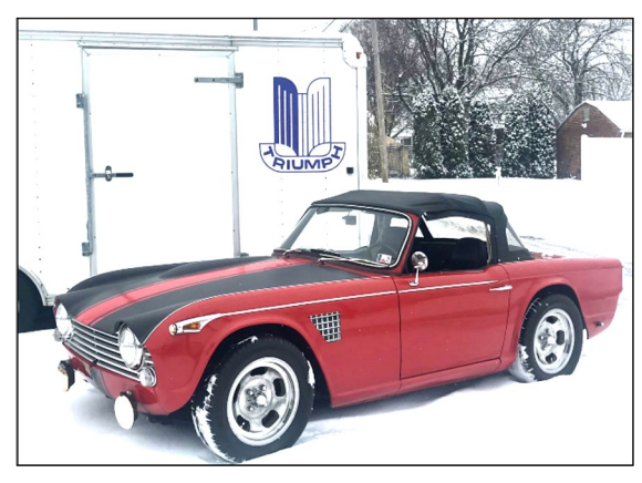
Stay Safe, Keep Calm and Motor On!

I hope that everyone has a healthy and a Happy New Year.