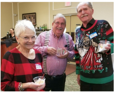
Continued on Page 6