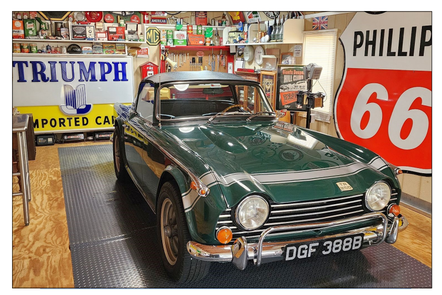
Triumph TR250 in the garage - Awaiting spring in central PA Owner: John Krause