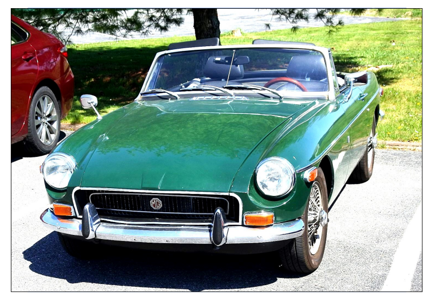
1970 Split Bumper MGB - Owner: Rory Liebrum