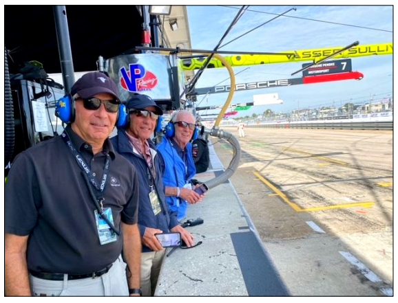
(Author: Left, Front)

One of my friends who joined us just retired as the head of Ford racing division; so he was a great resource of information and suggestions about where to stand, what to watch for, and great stories! He also arranged for us to have headsets that allowed us to listen to the Lexus team communicating between themselves and the drivers with tech information on race strategy and pit stop schedules.