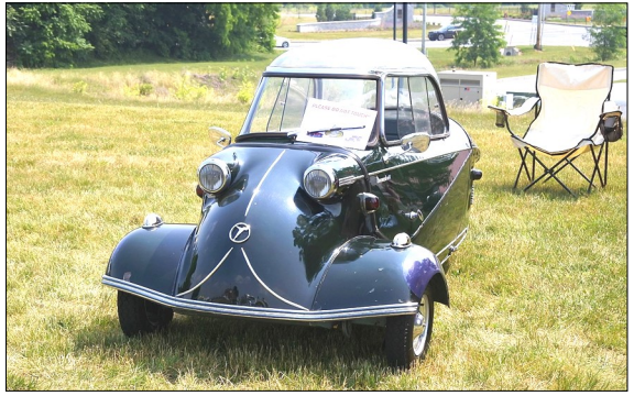
Truly a great day for a classic car show!