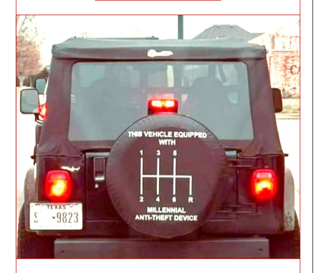
*Submitted by Howard Zlotoff