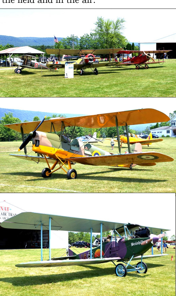
British, French and German biplanes were the most common aircraft of WWI and, inevitably, mock dogfights became the norm at the show.

Biplanes, of course, were the stars of the show, with many fine examples both on the field and in the air.