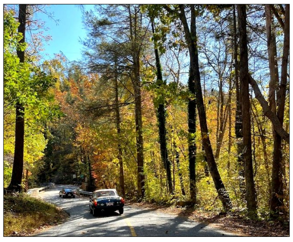
Continued on P. 6

The tour followed a nice selection of lightly-travelled blacktop, with lots of reds and yellows on the trees. Once we entered Bull Road, the scenery was even more familiar, as I use that route to fill up with non-ethanol fuel at Dottie's. The fall colors were abundant along Bull Rd., forming a tunnel through the trees.