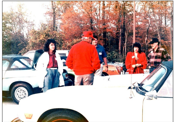
Gathering for the first CPTC Fall Leaf Tour. Many more would follow, with another coming up in October - Stay tuned!