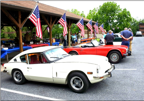
Next on the day's agenda was ... Food! A delicious spread from the great folks at Mission BBQ.