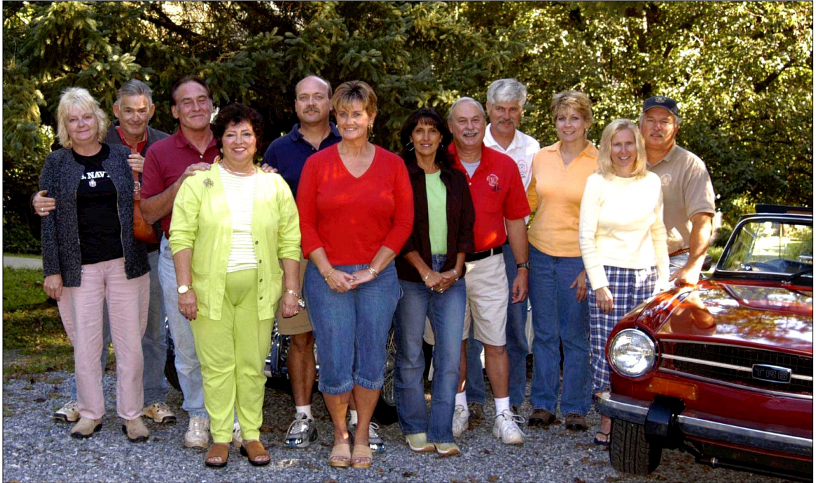
A number of Charter members & spouses - September 2004