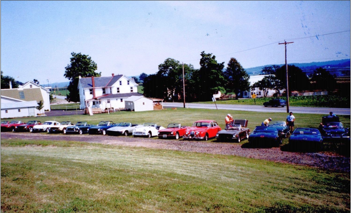
CPTC Run to the Strasburg Railroad - August 1992