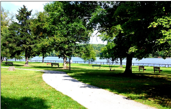
And so ended a beautiful afternoon with good friends in a great setting. Let's do this again next year!