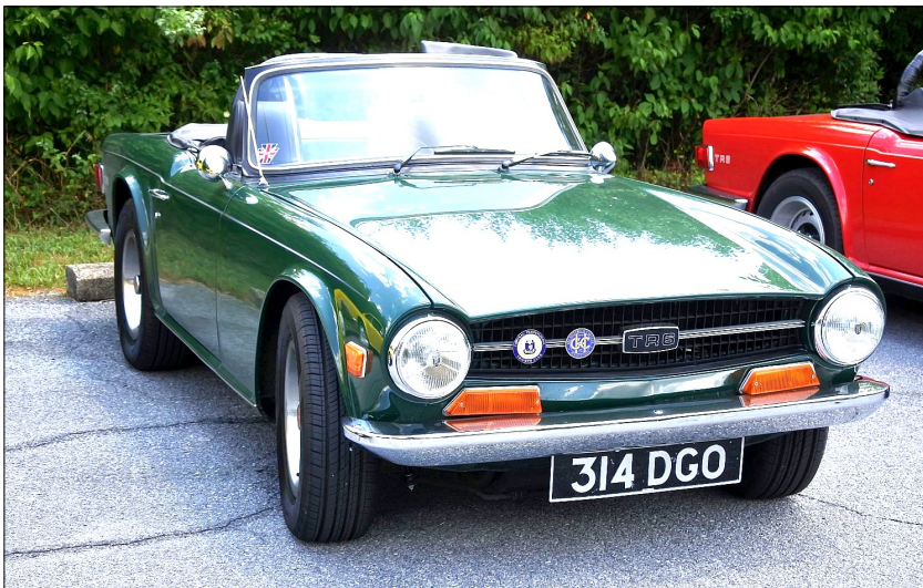
1969 Triumph TR6 Owners: Ed & Helen Fitzsimmons