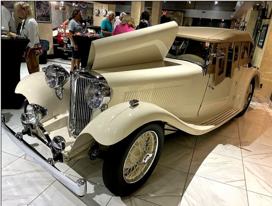
(Jaguar SS Tourer)

Friday night's reception was at Lenny Fiore's impressive Classic Car Museum in downtown Altoona. If you are in the market for a new or used vehicle of many makes, he has dealerships all over town. His garage is a four story brick and concrete building with 20 pristine show cars for viewing by the participants.