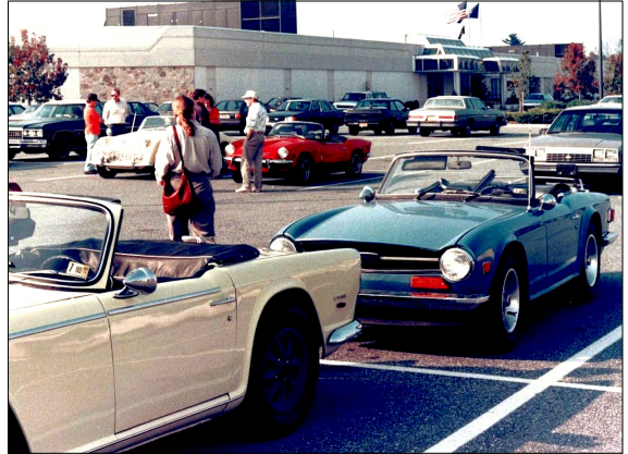
Queuing up for a run - Spring 1991